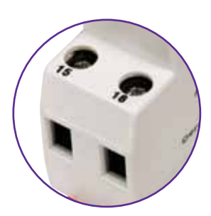
Integral Heat Sink Factory Tested Thermal Management.