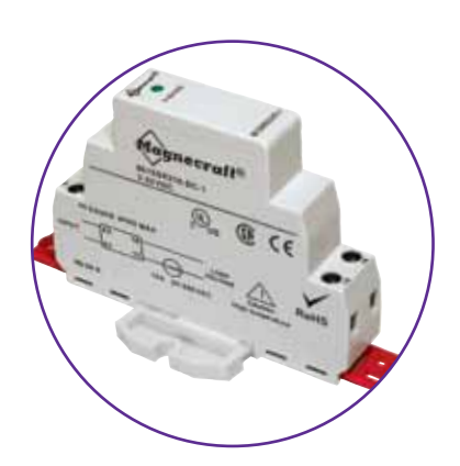
Optional Panel Adapter (16-788C1) See Section 3 p.18

We at Magnecraft are excited at the breadth of products and solutions we are able to offer engineers and designers. And this is just the beginning. We will continue to develop high value products—with innovative features not offered anywhere else in the industry.